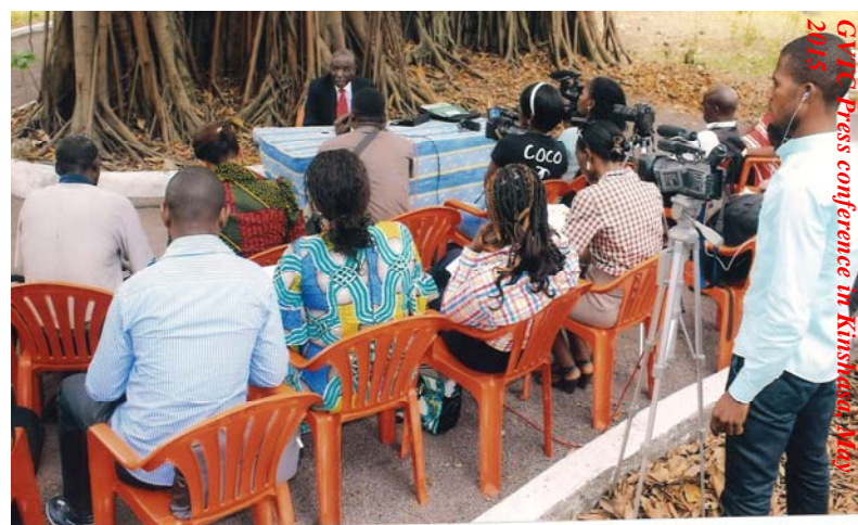
GVTC Press conference in Kinshasa, DRC, 2015

At its beginning, GVTC received financial support from some donors to operate and implement its Strategic Plan: American State Department, Sweden, the Kingdom of the Norway and currently from the Kingdom of the Netherlands.