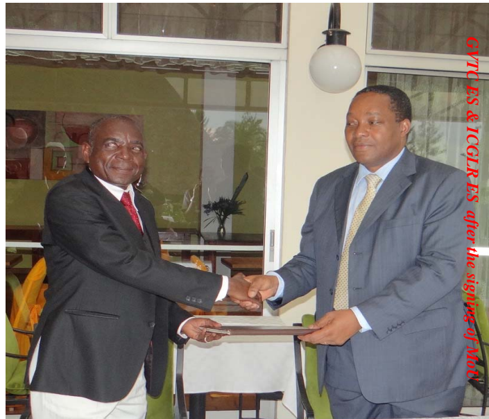
GVTC ES & ICGLR ES after the signing of MoU

2009: The Greater Virunga Transboundary Collaboration is institutionalized between DRC, Rwanda & Uganda through an interministerial board