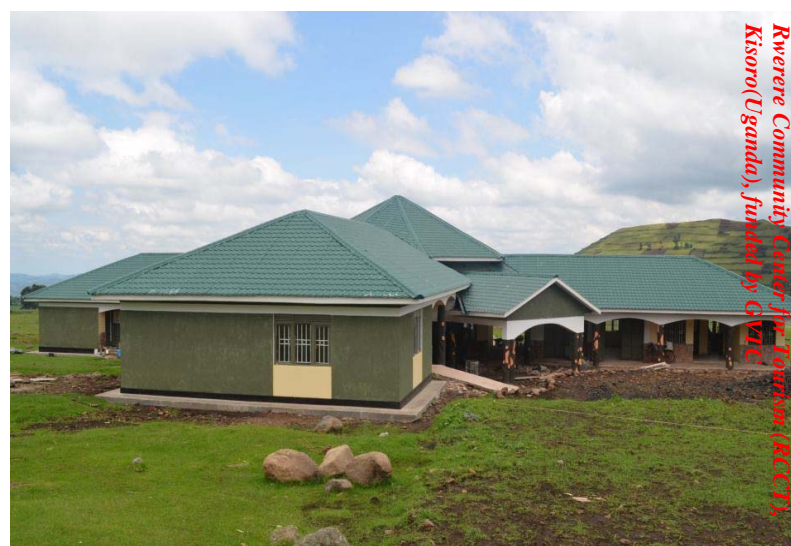
Rwerere Community Center for Tourism (RCCCT), Kisoro (Uganda), funded by GVTC