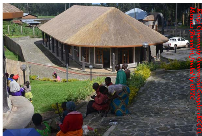
Kinigi Community Commercial Complex (KCCO), Musanze (Rwanda), funded by GVTC