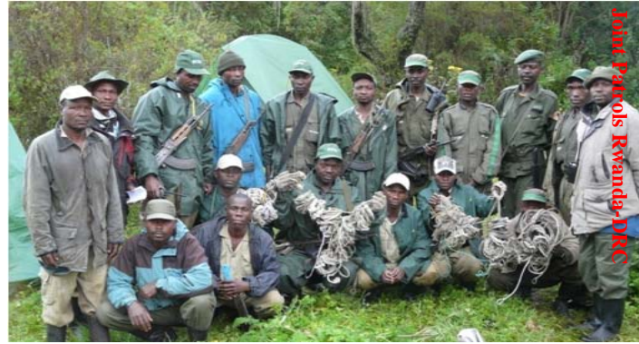
Joint Patrols Rwanda-DRC

1990: Informal collaboration between the park wardens of Rwanda, Uganda and DRC to monitor trans-border movements of mountain gorillas. The Greater Virunga Transboundary Collaboration (GVTC) was then born during armed conflicts.