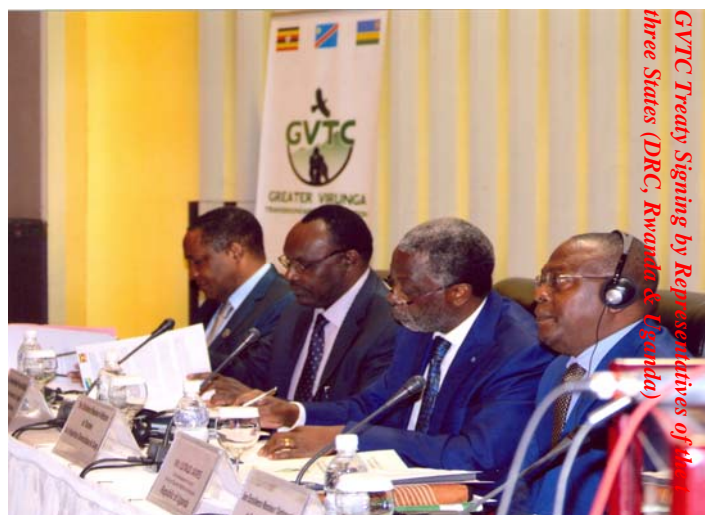
GVTC Treaty Signing by Representatives of the Three States (DRC, Rwanda & Uganda)

2015: Signing of the Treaty on the Greater Virunga Transboundary Collaboration on Wildlife Conservation and Tourism Development.