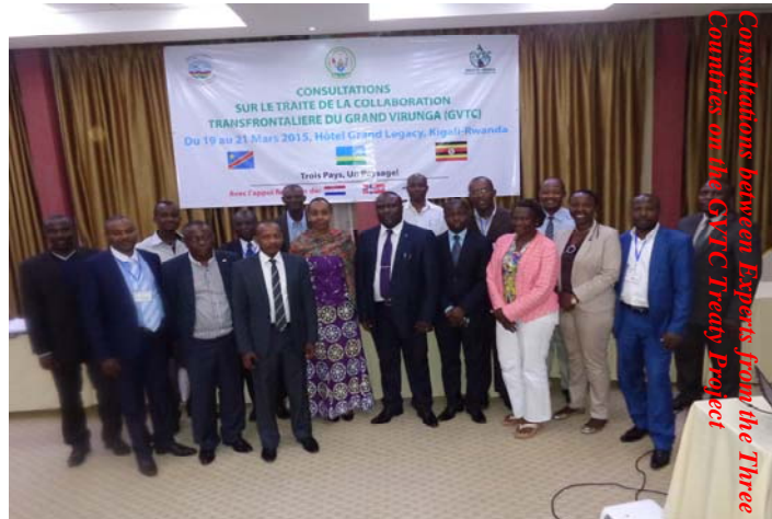
Consultations between Experts from the Three Countries on the GVTC Treaty Project

2014-2015: GVTC actively participated in regional and international conferences organized by the Congo Basin Forest Partnership (CBFP); GVTC is now member of CBFP.